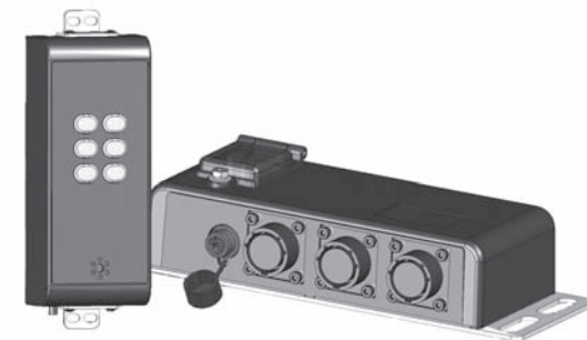
CVR100 Remote Control Sold Separately

Note: All cables provided are intended to be installed in only one direction. The cables are labeled as to direction (Front or Rear) or component they plug in to. Connections are made by either aligning the alignment marks on the connector or by aligning the connector keys.